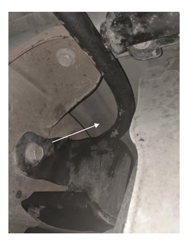
(Fig. 9) Run this 5/8" hose between the frame and truck bed.