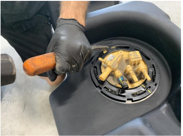
(Fig. 5) Tighten the top TITAN Torque hold-down ring onto the sending unit by turning it clockwise as far as it will go.