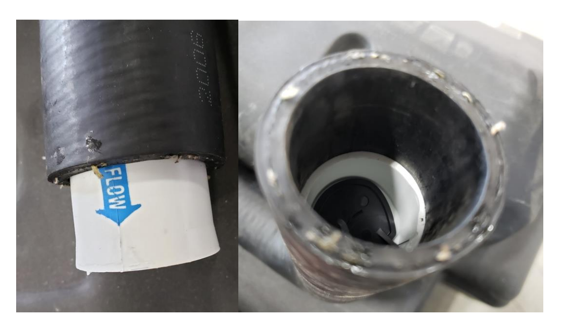
(Fig. 11) Insert 1-1/2" Fill Pipe ICV into fill hose with the "Flow" arrow pointing towards the fuel tank. This will need to be inserted deep enough to allow the fill hose to fit completely over the king nipple.