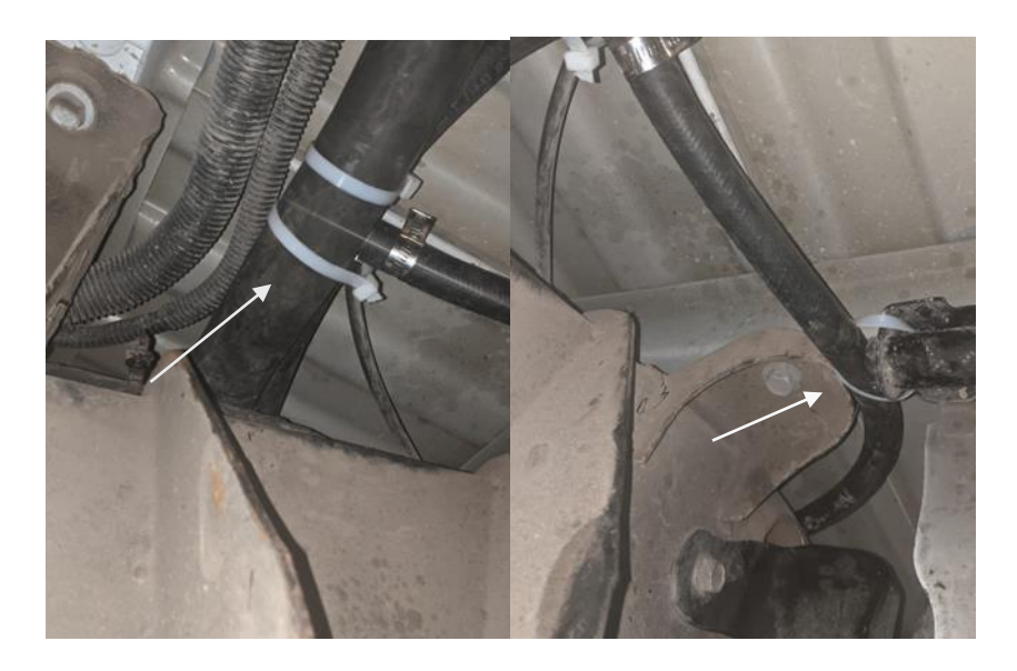
(Fig. 10) Zip tie the hose into place to prevent it from sagging in the future. Zip tie the tee to the top of the filler neck hose. Tighten all hose clamps appropriately.