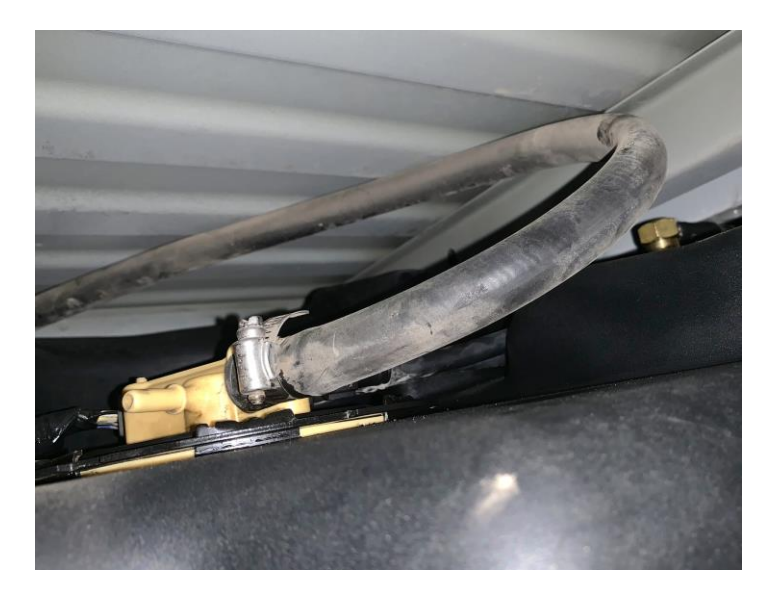
(Fig. 8) Lift tank high enough to reconnect electrical connections and vent line to the sending unit.