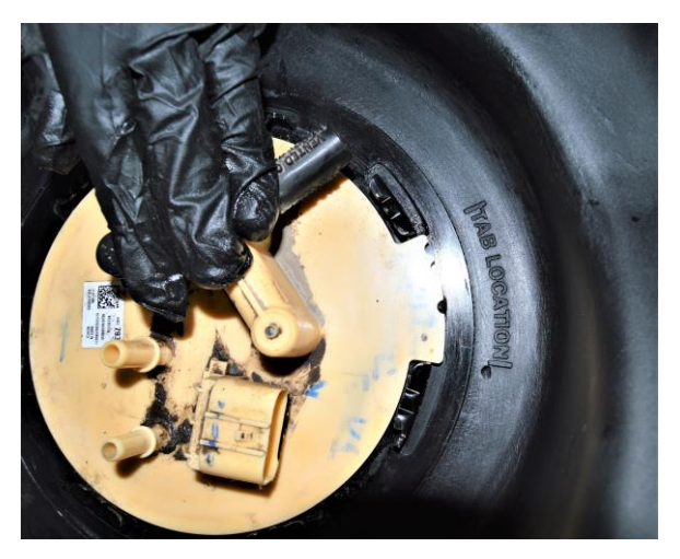
(Fig 4) Line tab on sending unit up with "Tab Location" marks on the TITAN tank.