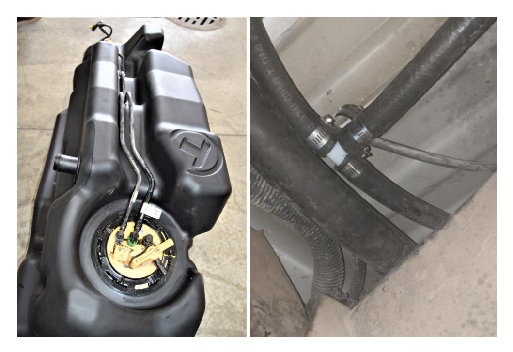
(Fig. 6) New TTITAN tank with fuel lines connected to the sending unit and in place.