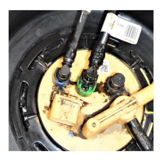
(Fig.2) Disconnect fuel lines at the sending unit using pick.