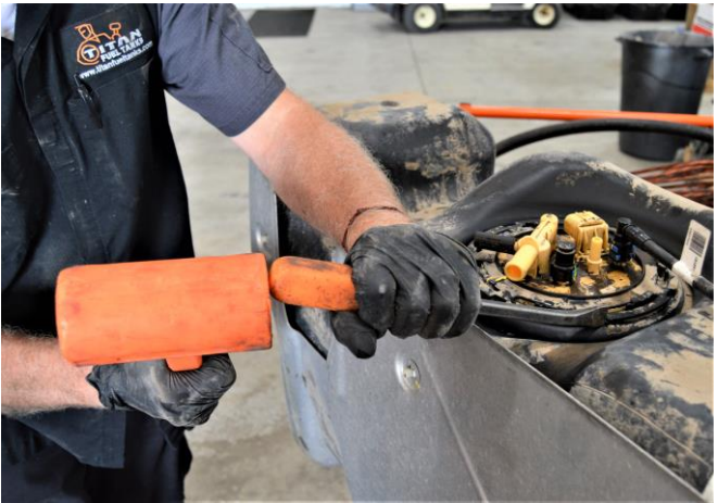
(Fig.3) Loosen hold-down ring on OEM tank by tapping counter-clockwise, remove and lift out sending unit.